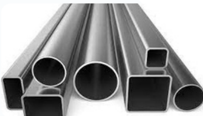
Pipes & Tubes

Nuts Square Weld Nuts Square Thin Nuts Acorn Nuts T-Slot Nuts Nylock Nuts Nylock Jam