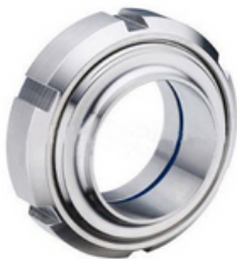
S.S SMS UNION