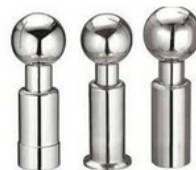
S.S TC SPRAY BALL VALVE