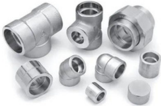
Forged & Ferrule Fittings

Stainless Steel: ASTM A182 F304/304L/304H/316/316L/317/317L/321/310/347/ 904L etc.