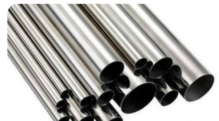
S.S ELECTRO POLISH PIPE