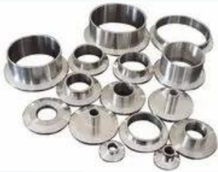
S.S TC FERRULE NB & OD