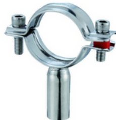
S.S PIPE HOLDER IMPORTED