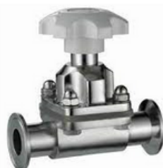
S.S TC DIAPHRAGM