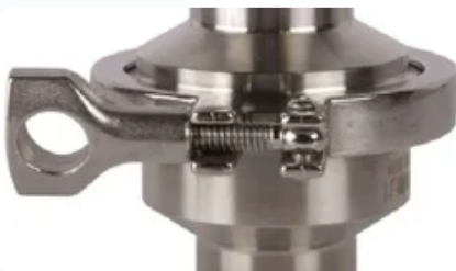
S.S TC NRV