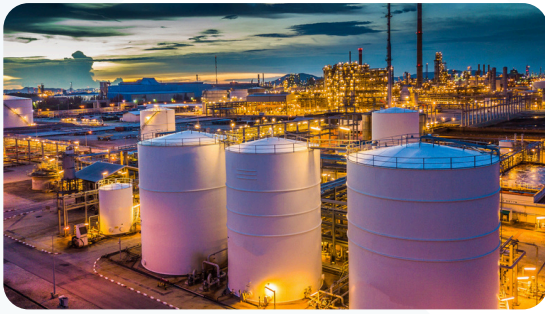
Oil & Gas Industry