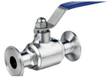
S.S TC BALL VALVE