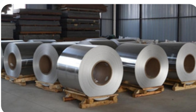
Plates, Sheet & Coil

Stainless Steel Coils, Sheets & Plates as per ASTM A 240 Gr. TP 304, 304L, 304LN, 309, 3095, 309H, 310S, 310H, 316, 316L, 316H, 316LN, 316TI, 317, 317L, 321, 321H, 347, 347H, 348, 348H, 409, 410, 420, 430 etc.