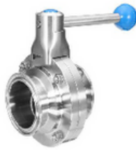
S.S TC BUTTERFLY VALVE