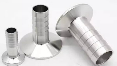
S.S TC HOSE