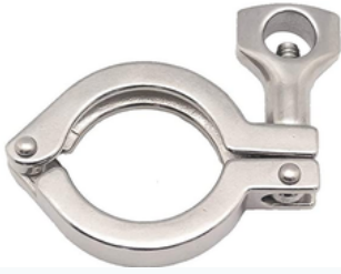
S.S TC CLAMP