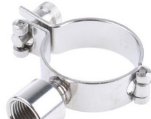
S.S PIPE HOLDER INDIAN