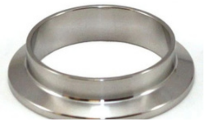
S.S TC S/W FERRULE