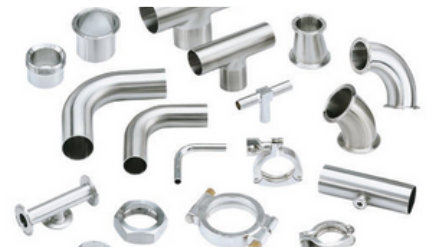
S.S EP DAIRY FITTING